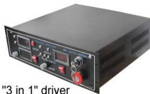
"3 in 1" driver